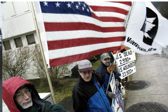
Veterans' for Peace, Juneau AK

A few problems however: I've more readily found an audience on the West Coast than I have in my own East Coast neighborhood. Despite invitations from three Friends meetings, I've been disappointed that many other Quaker and AFSC groups I invited to host shows were unresponsive. Despite good publicity and personal contacts, the turnout has too often been slim.