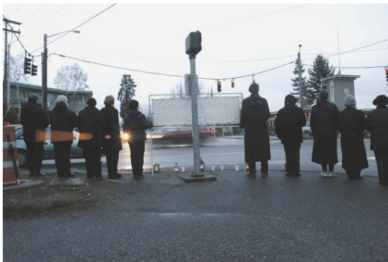
Women in Black, Bainbridge Isl, WA

I met different peace groups, such as the Veterans for Peace in Juneau and Juneau People for Peace & Justice, Women in Black on Bainbridge Island, the Japanese Buddhist order Nipponzan Myohoji, and the Lake Forest Peace Group in Seattle, along with many stalwart peace and justice activists. Samples here.