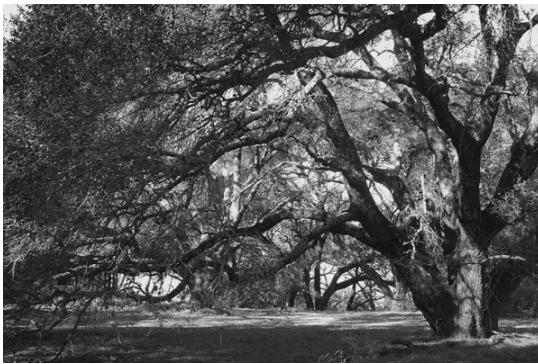
Live oaks, Napa, CA

As a bonus, along with visits to beloved family and friends, I experienced a range of terrains: Alaska from drippy Juneau to frozen Atlin, California's temperate and unseasonably dry climate, and Seattle's fog and rain. Luckily I was able to photograph much of this, and put it on my website for circulation. Samples here.