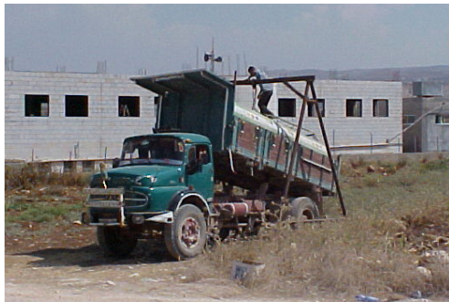
Water tanker trucks such as these are often prevented at Israeli checkpoints from collecting and delivering vital drinking water to Palestinian communities.