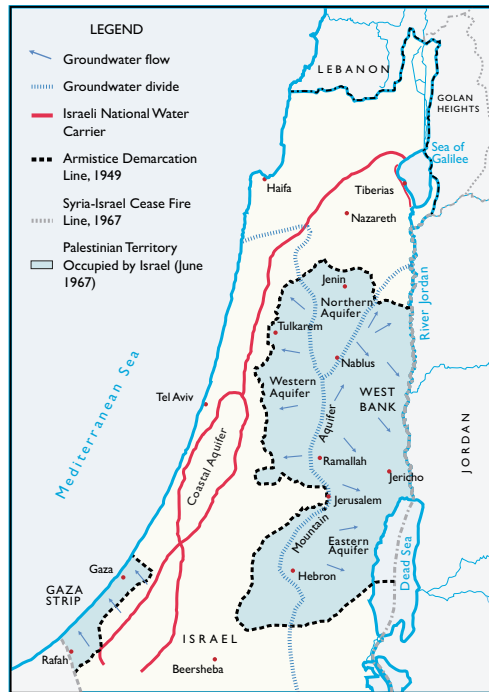
Courtesy Palestinian Academic Society for the Study of International Affairs (PASSIA). Adapted from: "Water and War in the Middle East" Info Paper no.5, July 1996, Centre for Policy Analysis on Palestine/The Jerusalem Fund, Washington D.C.

water disputes, set pumping quotas and forbade construction of new wells by Palestinians without permission from the area Israeli military commander. Since 1967, permits have been granted for only 23 new wells. 5