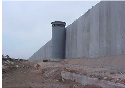
A section of the 'Separation' Wall that will come between many Palestinians and their water and land.