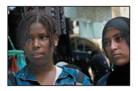
Palestinian Israeli students in Jerusalem