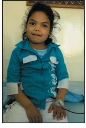
Cancer patient, Shifa hospital, Gaza