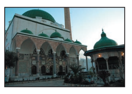
Al-Jazzar Mosque, Akka/Acre