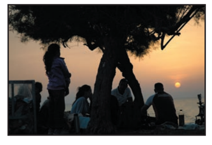
Mediterrean beach, Haifa