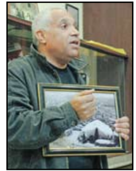
Dheheishe refugee camp, Bethlehem, Palestine