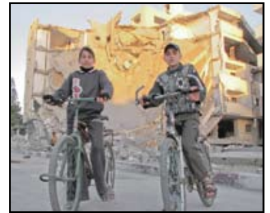
After an Israeli attack, Gaza City

With funding from private donations, grants, and money I raise through my