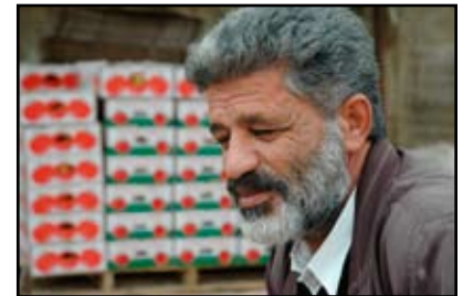
Tomato harvest, West Bank, Palestine