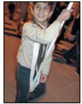
Bethlehem, West Bank, Palestine

teeksaphoto.org/Levant2006/Pages/Testimonials.html