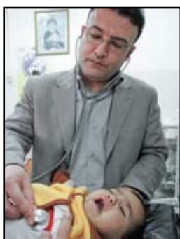
Nasser Pediatric hospital, Gaza City