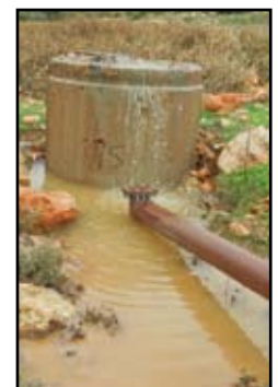
Untreated Israeli sewage, West Bank, Palestine