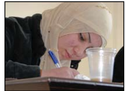
Writing workshop, Gaza City