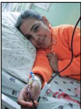
Nasser Pediatric hospital, Gaza City