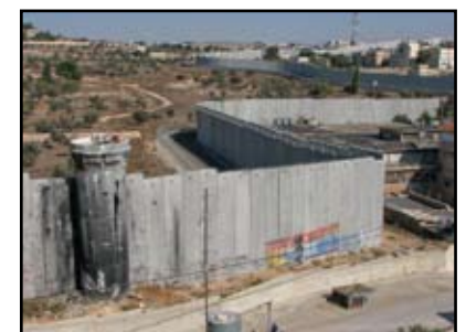
Separation wall, Bethlehem