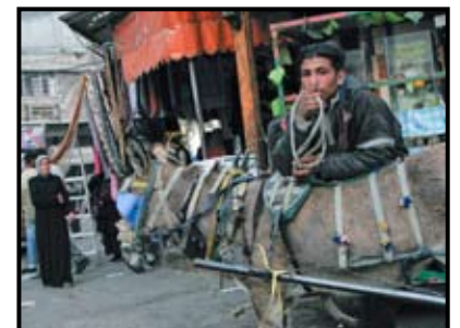
Rafah, Gaza Strip