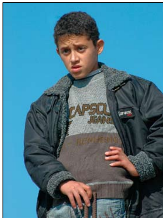
Funeral, Bureij refugee camp, Gaza Strip